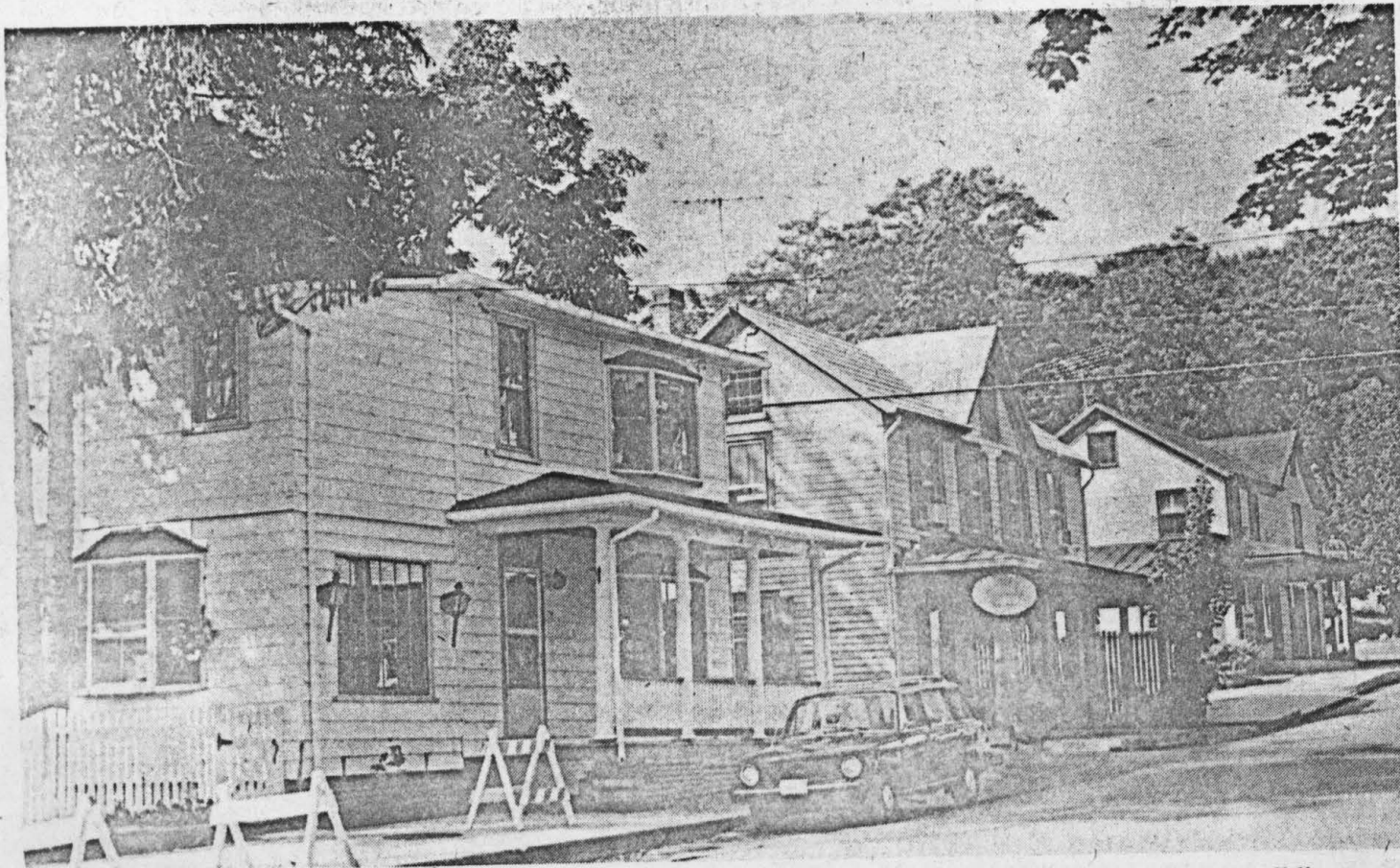
The Ballywhack Branch project is nearly complete, carrying the stream under these Union Street buildings

The bank, the post office, the ice cream parlor, the two churches, the cozy front porches of the homes which invite friends 'to come in and sit a spell' all help to make Occoquan the perfect hometown, not only for the people whose families have been long time residents, but also for the many newcomers who love Occoquan and want to share in its peace, its beauty, its past and its future.